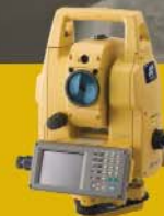
GPT-7000i Series Windows CE® Reflectorless Imaging Total Stations