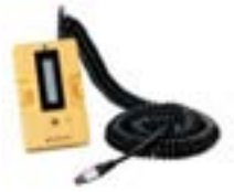
56102 RD-10 Remote Display for LS-70A